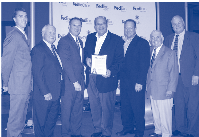
Fed Ex opened its $90 million hub in Perrysburg Township in July. This facility acts as a sorting and distribution point for packages headed to places such as Kalamazoo, Mich., and Fort Wayne, Ind., as well as communities of northwest Ohio.

The Commissioners appoint members to a variety of boards and commissions, such as the Developmental Disabilities Board, the Alcohol, Drug Addiction and Mental Health Services Board, the Airport Authority, and the Historical Society Board. The Commissioners have established a process whereby they meet in public session with every person that is appointed or reappointed to these Boards and Commissions. Citizen participation in local government is imperative and these meetings provide an excellent opportunity for the Commissioners to meet their appointees, establish good lines of communication, and thank them for their service.